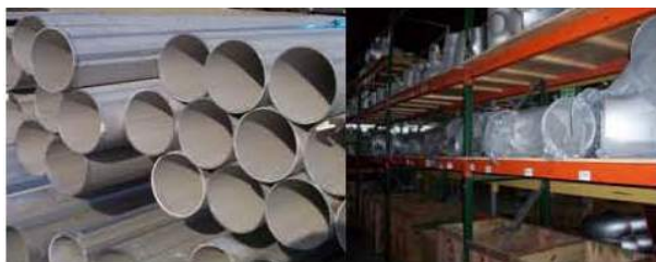
"15 acre pipe yard • 200k sf warehouse" In stock - 1/2"-24" carbon and stainless pipe & fittings

American Stainless & Supply, LLC is a wholesale distributor of industrial pipe, valves, fittings, controls and shapes, selling primarily to manufacturers and industrial contractors throughout the country.